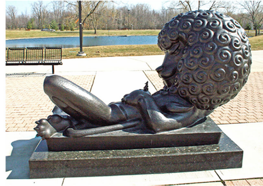
The Lion and Mouse