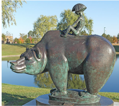
The Boy and Bear