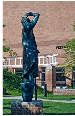
The Poet: Lord Byron