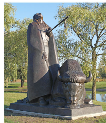
Black Elk: Homage to the Great Spirit