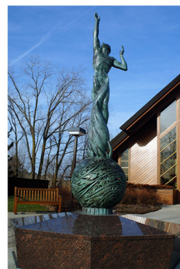
Cleveland War Memorial