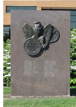
Eaton War Memorial