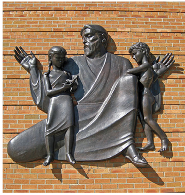
Christ and the Children