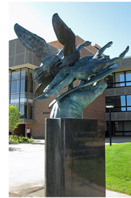
Wings of the Morning