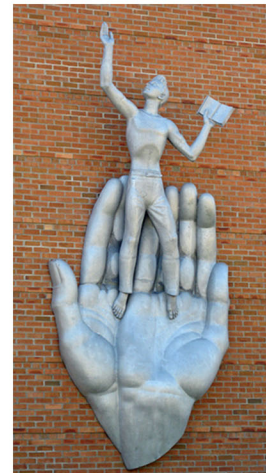
Youth in the Hands of God