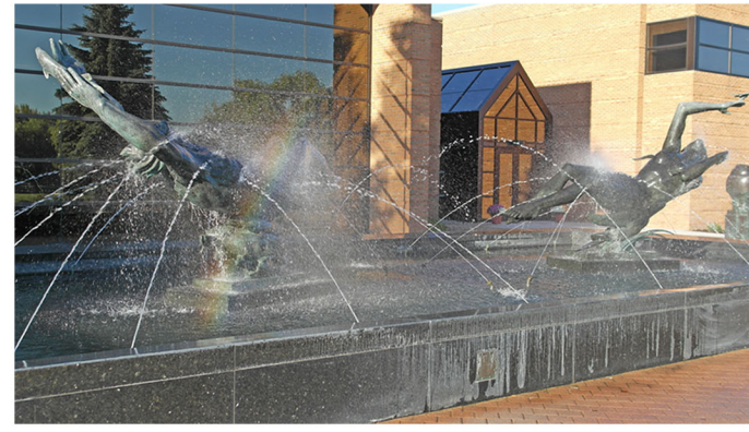
Night and Day Fountain