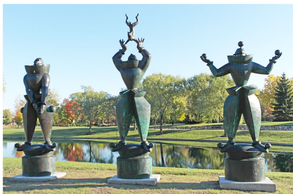
Lovesick, Acrobat and Juggler Clowns