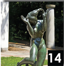
Persephone, Greek Theatre, Cranbrook, Bloomfield Hills