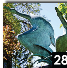
Flying Wild Geese, Northern Michigan University, Marquette