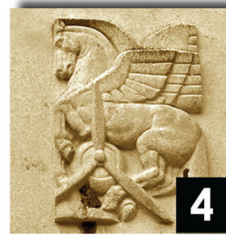
46 Reliefs Rackham Memorial Building, Woodward at Warren, Detroit