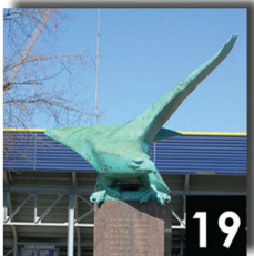
American Eagle, University of Michigan Stadium, Ann Arbor