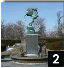
Levi L. Barbour Memorial Fountain, Belle Isle Conservatory, Detroit