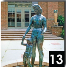
Two Sisters Fountain Kingswood School, Cranbrook, Bloomfield Hills