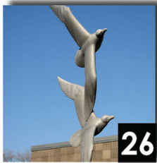
Flying Gulls Fountain, Loutit District Library, Columbus Ave., Grand Haven