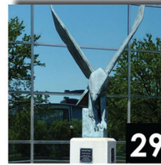
Victory Eagle, Gerald R. Ford Presidential Museum, Grand Rapids