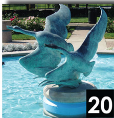
Flying Wild Geese, Andersen Enrichment Center, Ezra Rust Blvd., Saginaw