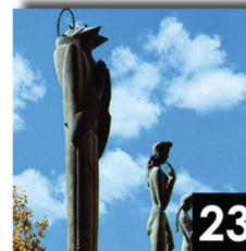
Seven Saints and Sinners, Midland Center for the Arts, Midland