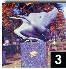
Flying Wild Geese, Elmwood Cemetery, Elmwood Ave., Detroit