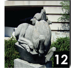
Siberian Ram, Baldwin Public Library, Bates at Merrill, Birmingham