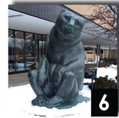
Two Bears, Sterling Heights Public Library, Dodge Park Rd., Sterling Heights