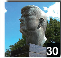
John F. Kennedy Memorial, Macomb County Building, N. Main, Mount Clemens