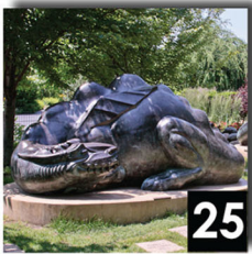
Friendly Dragon, Frederik Meijer Gardens and Sculpture Park, Grand Rapids