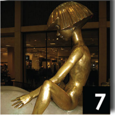
The Boy and Bear, Southfield Public Library