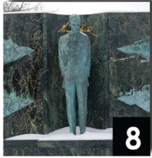
Henry Ford Memorial, Henry Ford Centennial Library, Dearborn