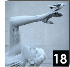
Night and Day Fountain, Henry J. McMorran Auditorium, Port Huron