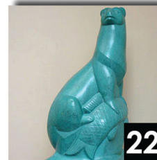
Otter, Krasl Art Center, Lake Blvd., St. Joseph