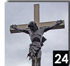
Christ on the Cross, Indian River Catholic Shrine (Cross in the Woods), Indian River