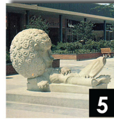
The Lion and Mouse, Eastland Shopping Center, Vernier at Kelly, Harper Woods