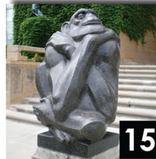
The Thinker, Academy of Art Museum, Cranbrook, Bloomfield Hills