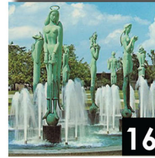
Seven Saints and Sinners, Oakland University, Rochester