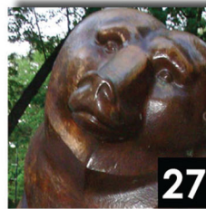
Two Bears, Interlochen Center for the Arts, Interlochen