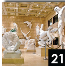
Marshall M. Fredericks Sculpture Museum, Saginaw