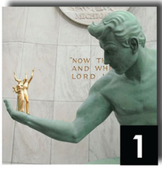
The Spirit of Detroit, Family and Justice Reliefs 1 Woodward Ave., Detroit