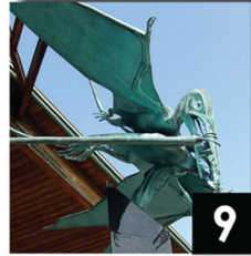
Flying Pterodactyls, Detroit Zoo, Royal Oak