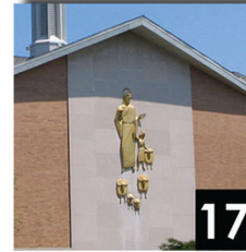
Christ the Good Shepherd, Central United Methodist Church, Waterford