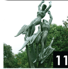
Freedom of the Human Spirit, Shain Park, Bates at Merrill, Birmingham